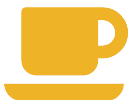
coffee & snacks