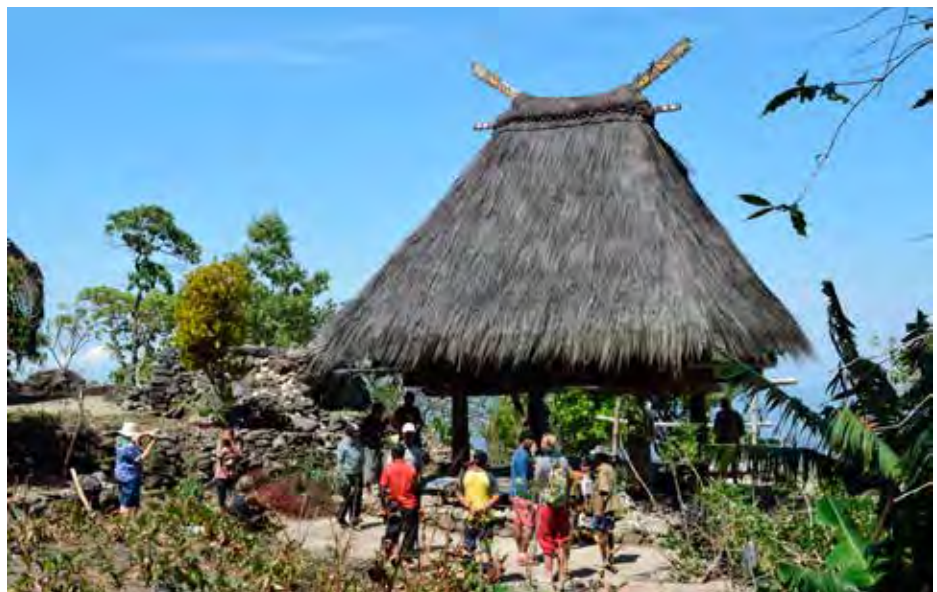
↑ Installation team at a thatch house. Daytime activities are carried out on the lower platform. A sleeping space and living room are in the upper level within the roof space. The addition of some lighting within this windowless space is a great advantage. A bamboo ladder is drawn up into the house at night for security.

Lessons learned from other well-meant aid programs have not been lost on the ATA. A