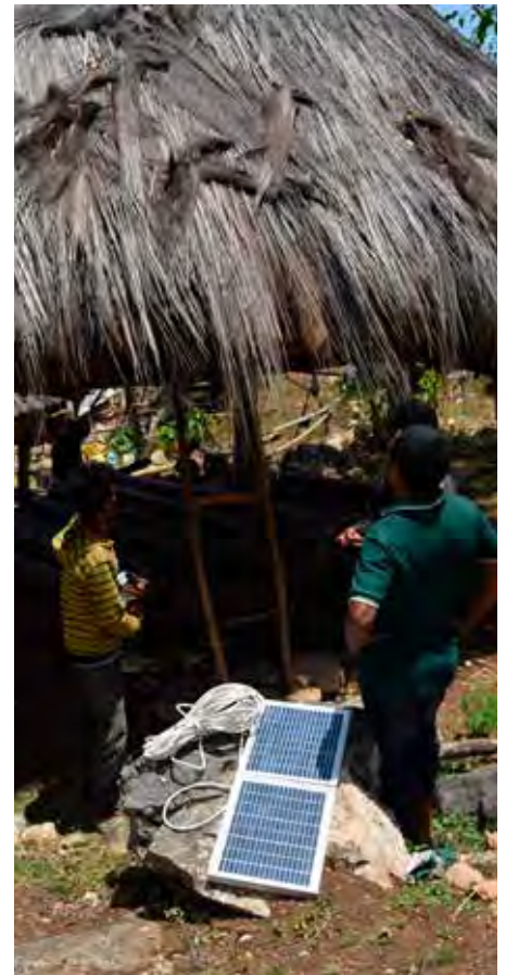
↑ Deliberations about attaching a solar panel to Grandpa's house.

For more info on the ATA's projects in East Timor, see www.ata.org.au/ipg .