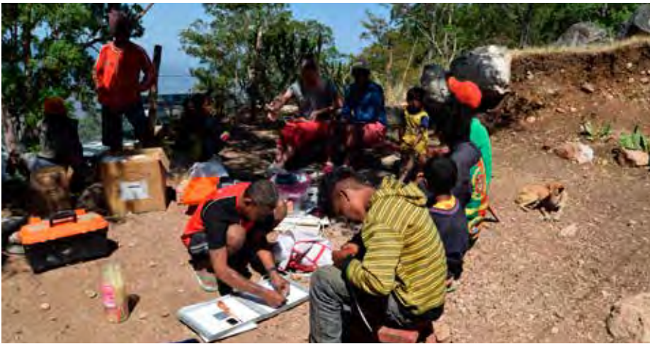
↑ Pre-wiring activities at our village base outside the eating and sleeping hut. Technicians and team members all pitched in.