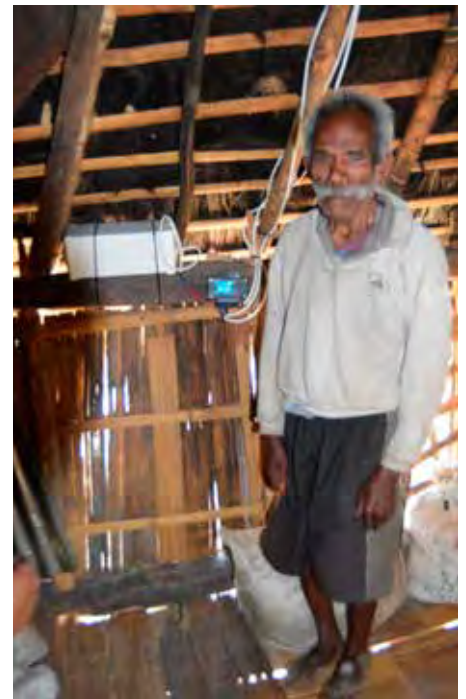
↑ Inside Grandpa's house, showing the battery box in the background and the charge controller inside the house.